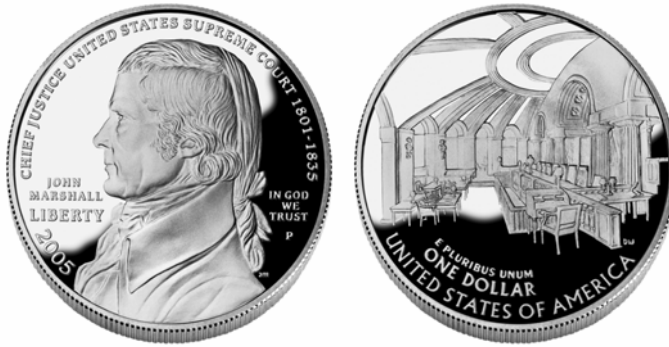
The Chief Justice John Marshall Silver Dollar

2005 Marine Corps 230 th Anniversary Silver Dollar: Designs for this Silver Dollar were unveiled in February 2005. Its release is slated for July 2005. The Marine Corps 230 th Anniversary Silver Dollar will be available in three product options: 1) a proof silver dollar; 2) an uncirculated silver dollar; and 3) one special set, which will also contain the Chief Justice John Marshall Silver Dollar. A surcharge from the sale of each coin is authorized to be paid to the National Museum of the Marine Corps in Quantico, Virginia, which is being developed through a partnership between the Marine Corps Heritage Foundation and the United States Marine Corps.