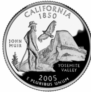
The California Commemorative Quarter-Dollar.