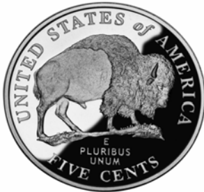
The 2005 American Bison 5-Cent Coin (Nickel).

In a conference report to Public Law 104-52, enacted November 19, 1995, which created the United States Mint Public Enterprise Fund (PEF), Congress directed the United States Mint to report quarterly on implementation of the PEF. This report is designed to fulfill that requirement.