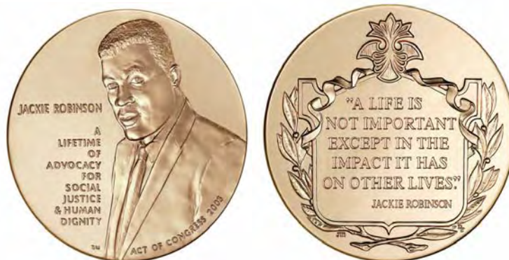
The Jackie Robinson Congressional Gold Medal

2005 Jackie Robinson Congressional Gold Medal: On March 2, 2005, in a ceremony at the United States Capitol Rotunda, the Congressional Gold Medal, which is Congress' highest honor to civilians, was posthumously bestowed to Jackie Robinson -- a baseball great, civil rights leader and political activist. Jackie Robinson's wife, Mrs. Rachel Robinson, accepted the medal from President George W. Bush. A three-inch bronze duplicate medal and a 1 1/2-inch miniature bronze duplicate medal replica are available to the public.